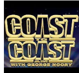
Art Bell: Somewhere in Time 8:00pm - 11:00pm