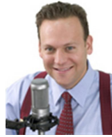
The Real Estate Expert 4:00pm - 5:00pm